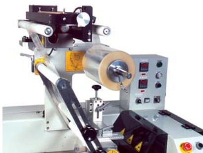
AHM 350T + Date coder