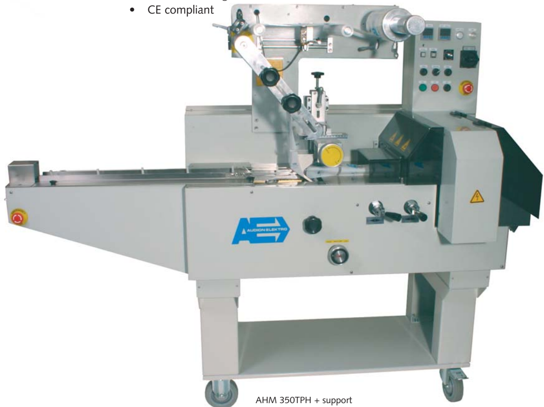
AHM 350TPH + support